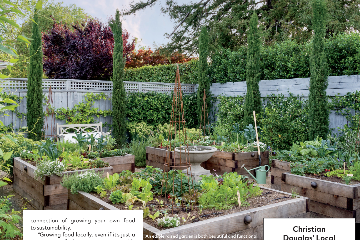
An edible raised garden is both beautiful and functional.

connection of growing your own food to sustainability.